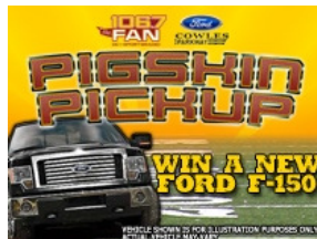
Win A Ford F-150