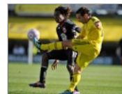
DC United vs Columbus Crew