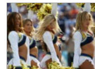
Cheerleaders of the NFL: Week...