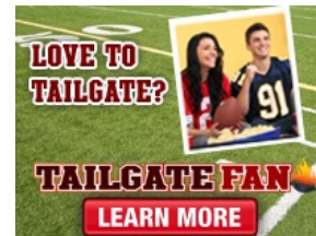
Official Tailgating Home

News Latest News | Entertainment | Politics | US News | World News | Galleries |