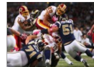
Washington Redskins v St...