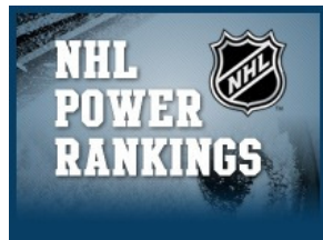
NHL Power Rankings