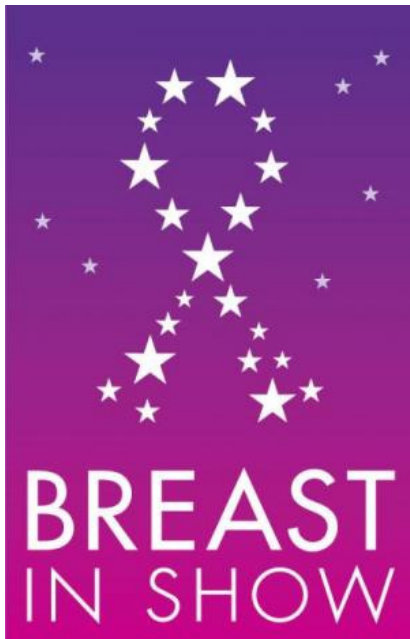
“Breast in Show” logo.